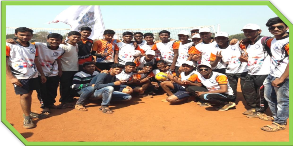
Traditional Day at ADCDP